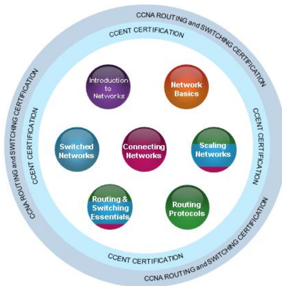
Figure 1. CCNA Routing and Switching Courses

Students will be prepared to take the Cisco CCENT® certification exam after completing a set of two courses and the CCNA Routing and Switching certification exam after completing a set of four courses. The curriculum also helps students develop workforce readiness skills and builds a foundation for success in networking-related careers and degree programs. Figure 1 shows the different courses included in the CCNA Routing and Switching curriculum.