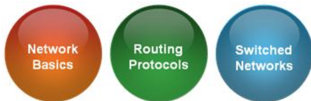
Figure 3. Additional CCNA Routing and Switching Courses to Support Transition

The three courses supporting transition; Network Basics, Routing Protocols, and Switched Networks, are offered with the following conditions: